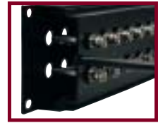
Vista trasera sujeción de cables Rear View