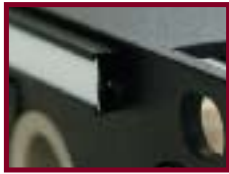
Perfil Porta-Etiquetas Label frame