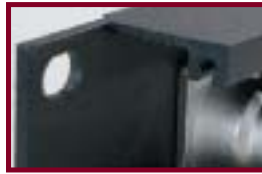
Perfil Panel muy robusto Strong panel frame