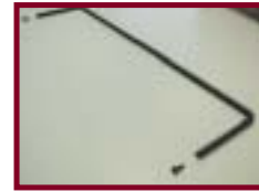
Varilla trasera para Rear bar to fix cables