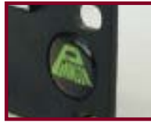
Logotipo incrustado Inserted logotip